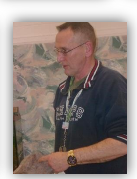
Page 11 April 2013 The Rockhounder