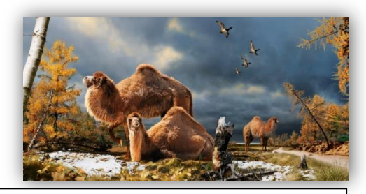
Illustration of the High Arctic camel on Ellesmere Island during the Pliocene warm period, about three and a half million years ago. The camels lived in a boreal-type forest. The habitat includes larch trees and the depiction is based on records of plant fossils found at nearby fossil deposits.